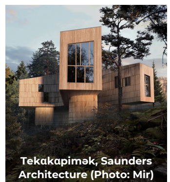
Tekakapimək, Saunders Architecture