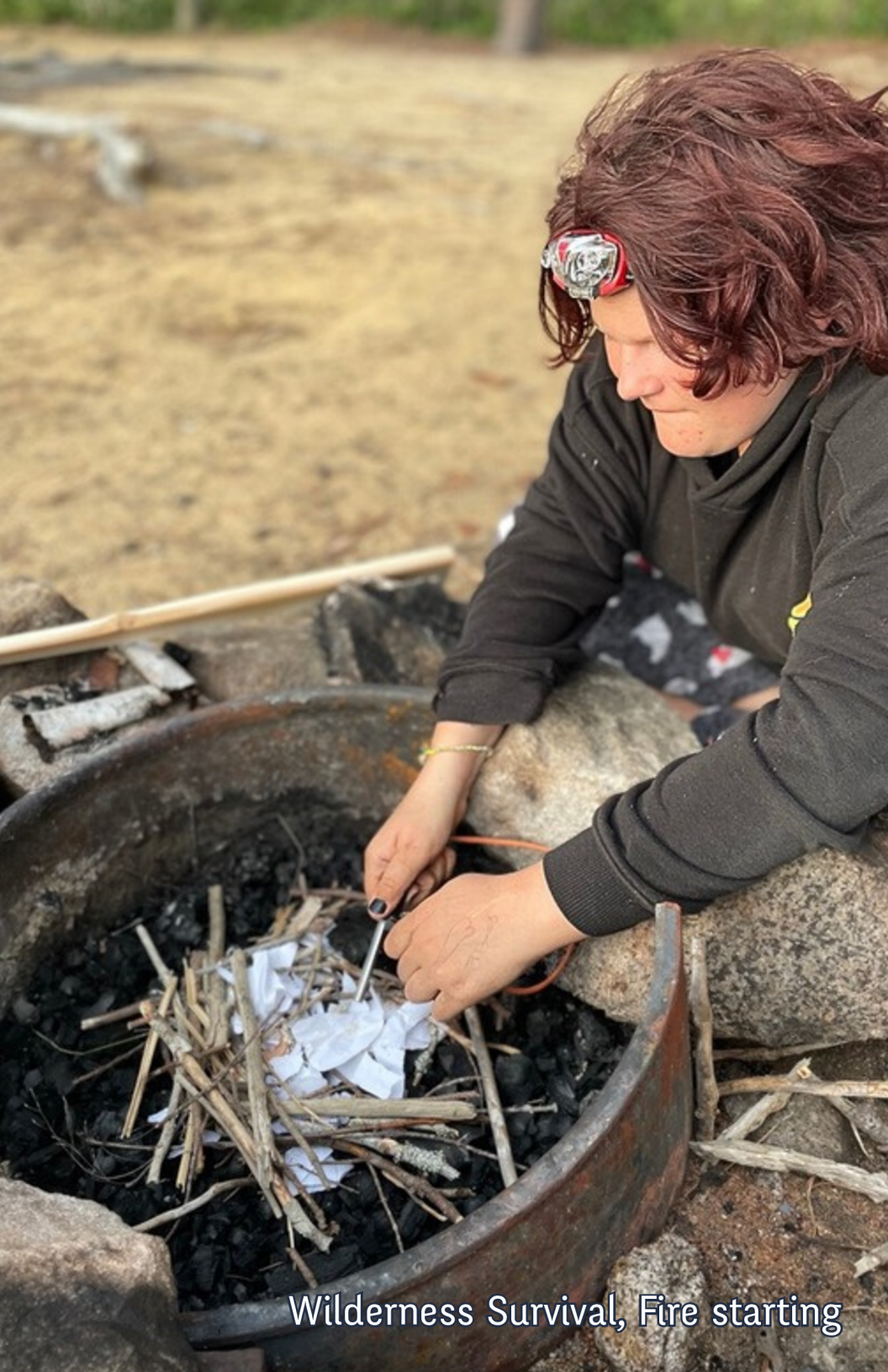
Wilderness Survival, Fire starting