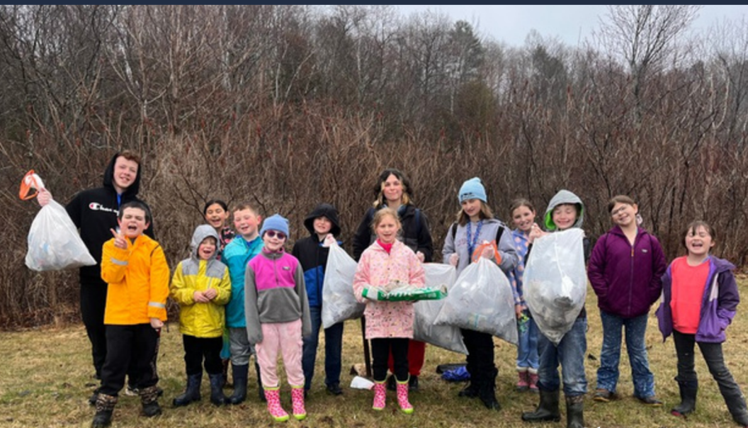
Community Clean Up

Are your students excited about giving back to their school or community? We're passionate about service learning and will help your students achieve success on their project.