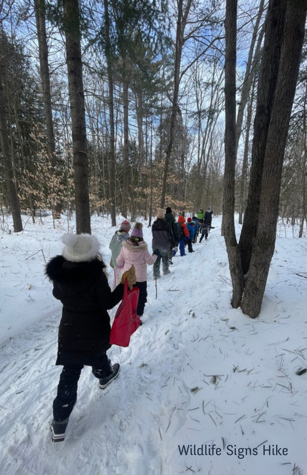
Wildlife Signs Hike