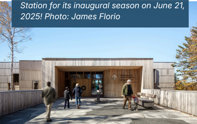
The NPS opened Tekakapimək Contact Station for its inaugural season on June 21, 2025!

This was most apparent during the prolonged federal shutdown from October 1st to November 12th. The shutdown created even more uncertainty for staffing, operations, and visitor services across the National Park System, placing added pressure on already strained parks. Throughout this period, Friends remained steadfast in our support, both publicly and behind the scenes. Most significantly, Friends provided an emergency donation to NPS in order to keep Tekakapimək open and staffed through Indigenous People's Day. We also worked through coordinated communications efforts to amplify key messages about visitor safety and respecting public lands.